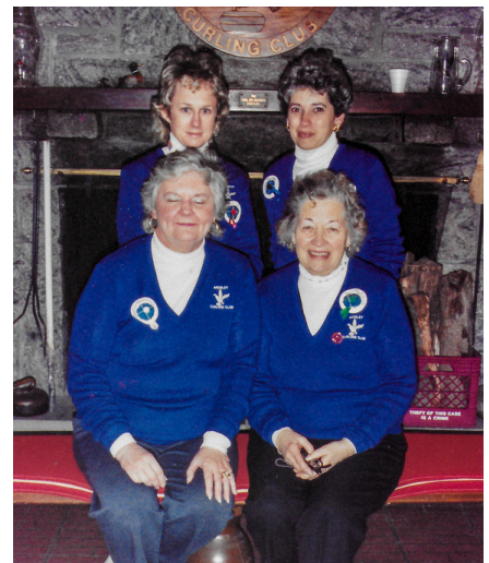
Empire State at Ardsley 1989