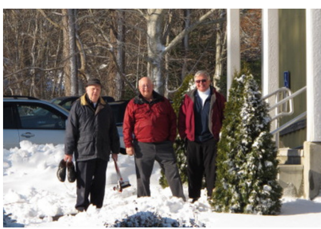
Curling at the Archie Bruce