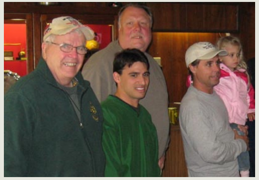
Headless Horseman Winners, with heads