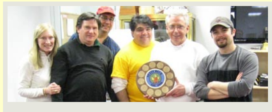
Nutmeg CC Nutty Duck Winners with Trophy