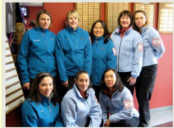
Team New York with Team Washington Post-Match