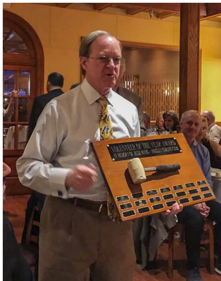
Volunteer of the Year 2019