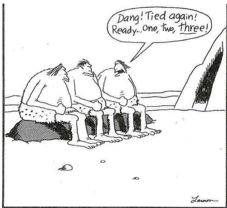
Before paper and scissors