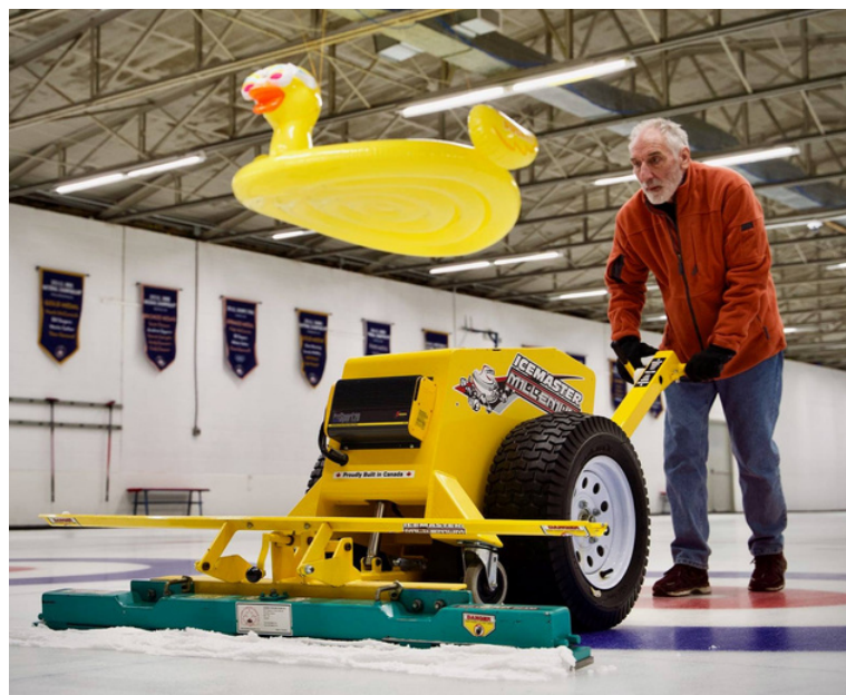
The Ice Man Cometh